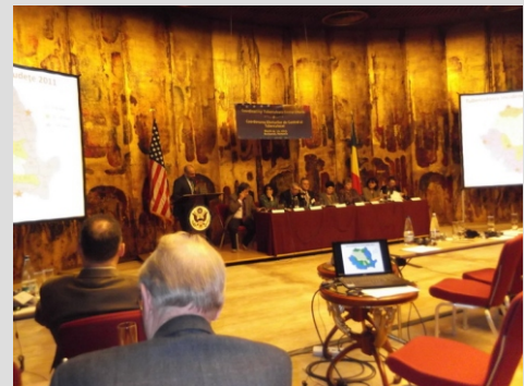
In the photographs above can be seen photos from the TB conference at Sovata recently attended by RCHF and also in March at a TB conference organized by the US Embassy in Bucharest.

Tuberculosis is still a major health problem in Eastern European Countries especially in both Romania and the Republic of Moldova. Both Countries lack in having a health care budget overall and lack in a specific health budget to address TB. There is no national TB prevention and education project and the public remain at large ignorant about Tuberculosis, despite it being a perfectly treatable illness if caught on time and if the full course of treatment is observed. Multi Drug resistant TB is now also alarmingly rising in both Countries often because poverty forces patients to give up on treatment and go find some work so they can feed their family. Here badly needed is a social back up scheme for TB patients in poorer families and on low income when a breadwinner is infected with TB and hospitalized as TB treatment last for 6 to 12 months.